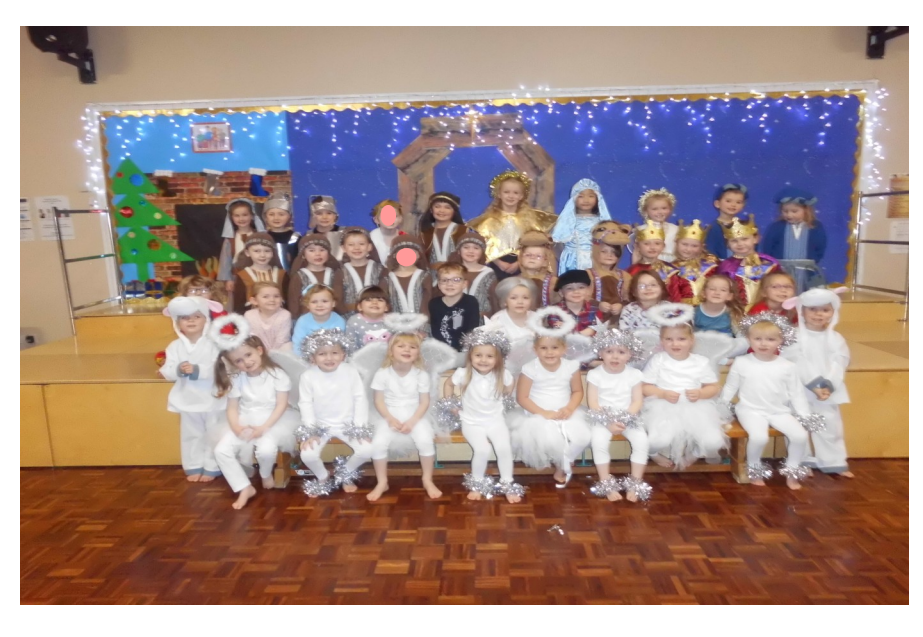
Year 1 and Year 2 "Hey Ewe"